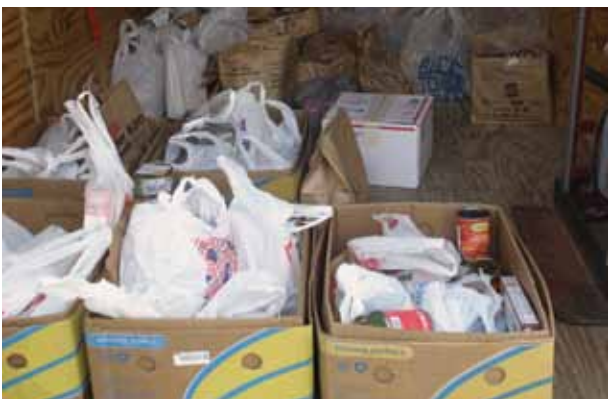
The collection for God's Helping Hands of Mecosta County at District 7 in Remus.