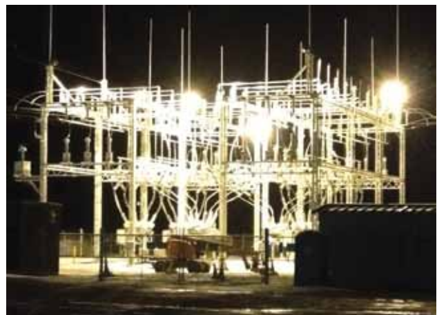
Construction to upgrade the Portland substation sometimes took place at night.