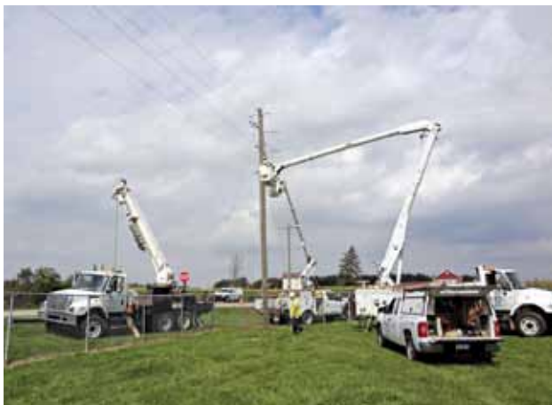
Crews work together to replace a broken pole.

Complete, audited financial statements are maintained at the Portland office of HomeWorks Tri-County Electric Cooperative, Inc. The independent audit of 2012 financial statements was unqualified, and completed by the certified public accountant (CPA) firm of Eide Bailly, Fargo, ND.